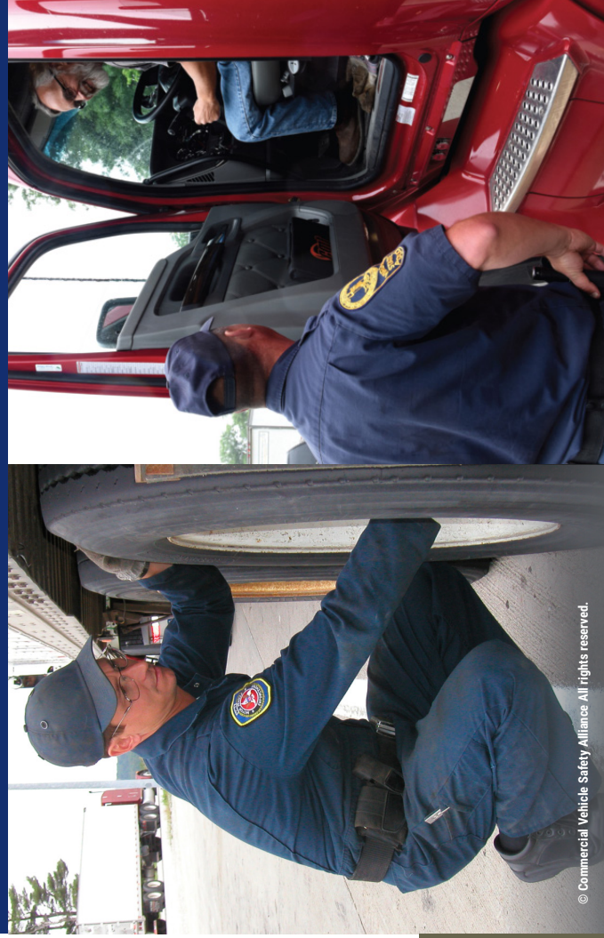
© Commercial Vehicle Safety Alliance. All rights reserved.

The Commercial Vehicle Safety Alliance (CVSA) is a nonprofit association comprised of local, state, provincial, territorial and federal commercial motor vehicle safety officials and industry representatives. The Alliance aims to prevent commercial motor vehicle crashes, injuries and fatalities and believes that collaboration between government and industry improves road safety and saves lives. Our mission is to improve commercial motor vehicle safety and enforcement by providing guidance, education and advocacy for enforcement and industry across North America. For more information, visit www.cvsa.org .